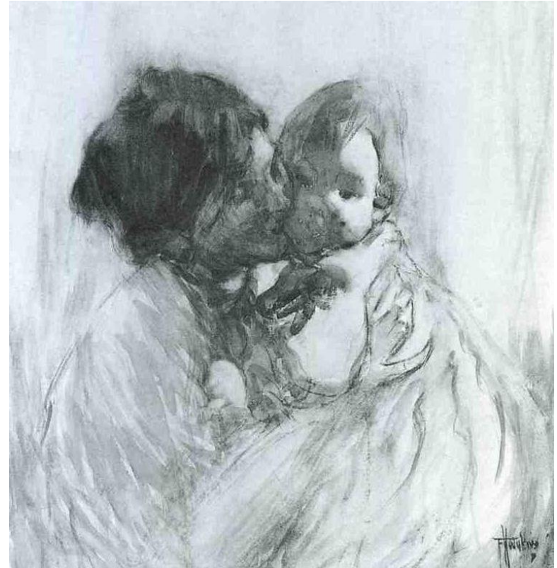
Mother and Child by Frances Hodgkins